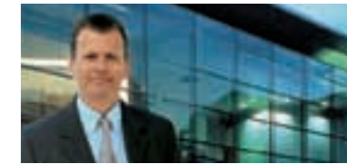
Dr. Ulrich Maly, Lord Mayor of the City of Nuremberg